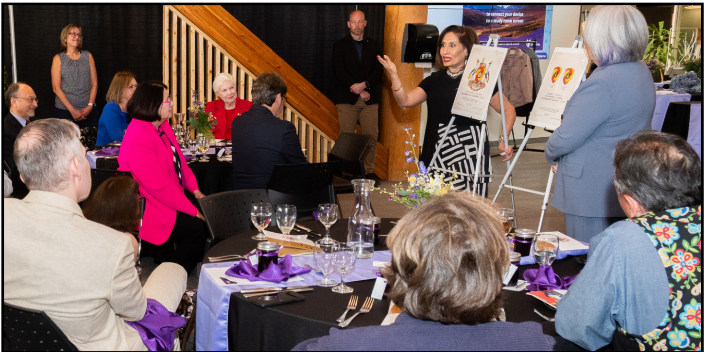
The Proclamation of a Grant of Arms for Her Honour, the Honourable Salma Lakhani, Lieutenant Governor of Alberta (by the dexter easel). These arms had been proclaimed by Her Excellency Governor General Mary Simon (standing beside the sinister easel). Other Vice-Regal attendees in the photograph are The Honourable Elizabeth Dowdeswell, Lieutenant Governor of Ontario (wearing a red dress and seated in the centre background) and The Honourable Janet Austin, Lieutenant Governor of British Columbia (wearing the fuchsia jacket).