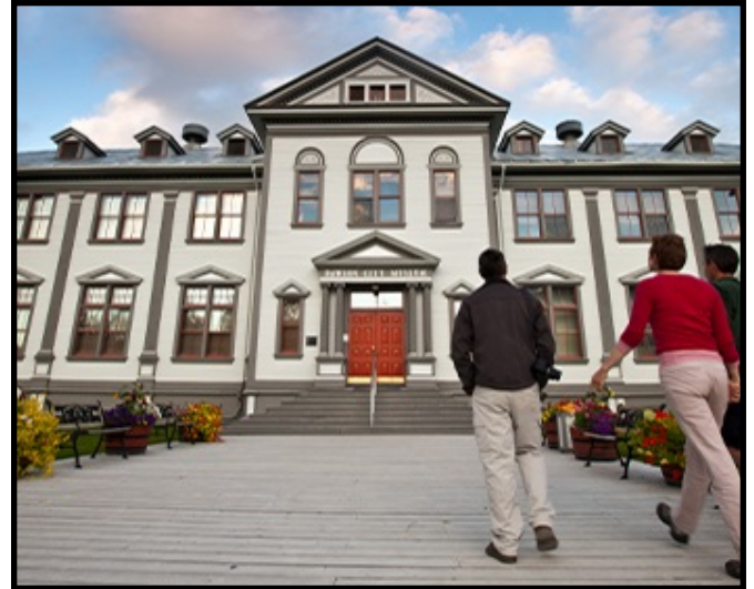
Dawson City Museum and former Territorial Administration Building. The special sitting of the Yukon legislators was held on the June 13th anniversary in the original Territorial Council Chambers in the building.

June 13th was the 125th anniversary of Yukon joining the Canadian Confederation as a new Territory. Various local events recognized the anniversary. A significant celebration was a special sitting of the Yukon Legislature in the original Territorial Council Chambers in Dawson City, the original capital.