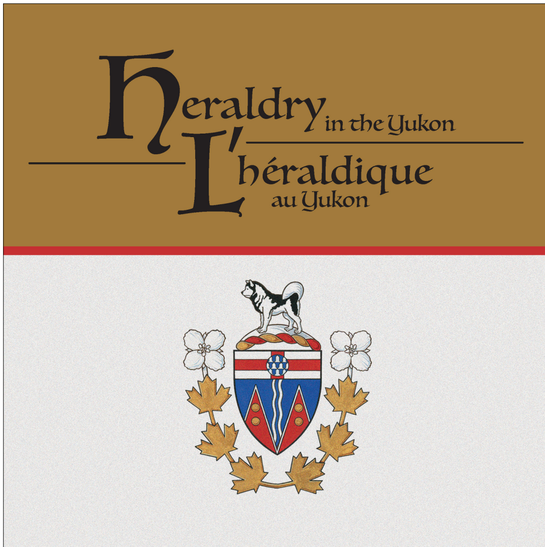
Cover of the new Heraldry in the Yukon booklet.