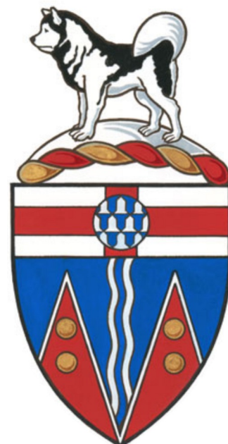
Arms of the Territory of Yukon Approved by Queen Elizabeth on February 24, 1956