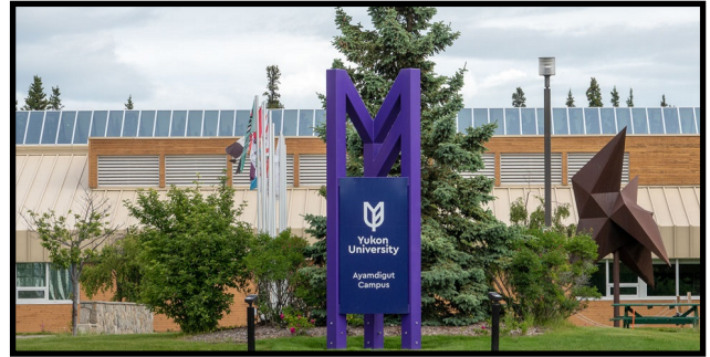
Yukon University, Whitehorse, Yukon

We had a very enjoyable discussion about Her Excellency's arms that had been granted on August 12, 2022. It is always interesting to hear from a grantee how they developed their arms. Her Excellency was well aware that she is our Patron.